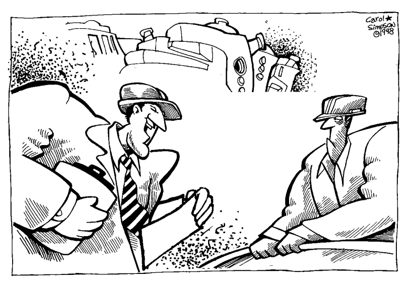
"Everyone makes mistakes, Hargrove ... That's why we have termination procedures!"

It is illegal to terminate an employee for joining a union. It is your right under the law to seek union representation.