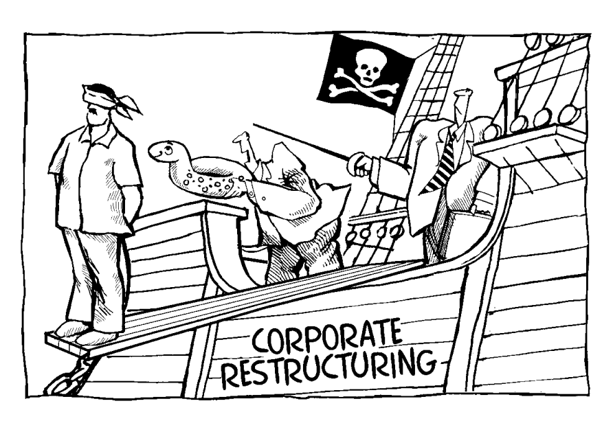
"Our apologies. We forgot your severance package."

Many of the employers who hire Local 399 members contribute to a pension plan per the contracted agreement. Over the course of a career as a Local 399 member, pension contributions can accumulate to a generous pension when you retire. Why wait until you're about to retire to realize that you and your family may have to live solely on Social Security, if it still exists. Anyone born after 1937 will not receive full benefits at age 65. Each year, the age to qualify will go up. What will it be 10 or 20 years down the road? If you've invested in the stock market, let's hope the economy is better than it is now when you're ready to retire. Even the experts can't predict what will happen with the stock market. You're at risk if you have a company retirement plan. Companies go bankrupt and aren't able to fund their pension programs. If you have a 401k plan, you should be aware that many companies have reduced their participation into these programs.